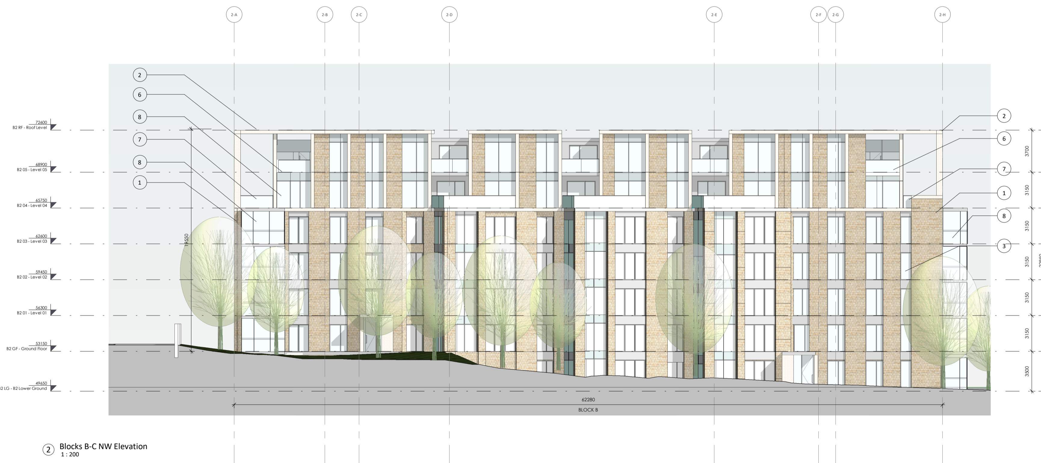
2 Blocks B-C NW Elevation 1:200