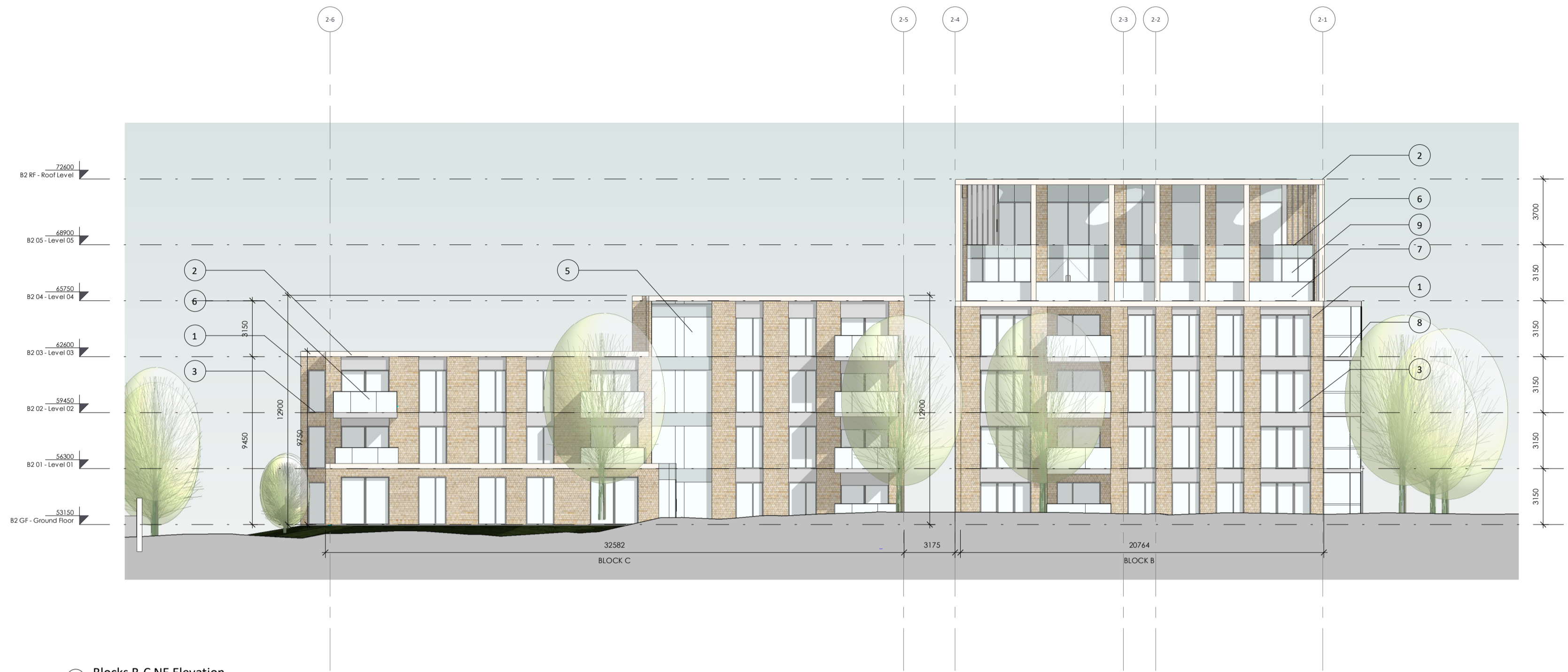
1 Blocks B-C NE Elevation 1:200